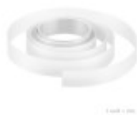
1 roll = 10m